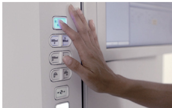
Therapist uses a "follow the light" methodology for managing treatment