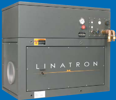
6 MeV Linatron X-ray Head

Varian Linatron® high-energy X-ray linear accelerators are available in single and dual-energy versions that provide X-ray outputs from 2 MeV to over 15 MeV depending on customer requirements. Linatron accelerators for security scanning applications are available with an interlaced dual-energy option, which allows systems to perform enhanced material discrimination by alternating energies from pulse to pulse.