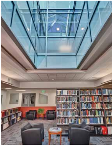
The R&D library at Building 4 in Palo Alto, with one of four massive light wells above.

Varian's Salt Lake City facility achieved a 73% solid waste recycling rate in 2010