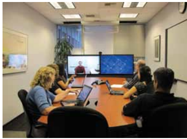
| Videoconferencing at Varian.